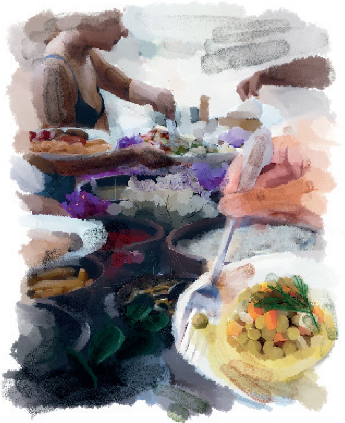
MAÇAKIZI LUNCH BUFFET